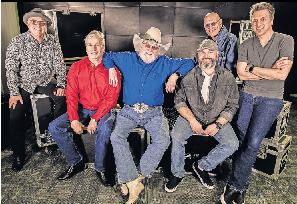
Charlie Daniels Band